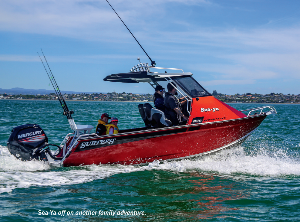
Sea-Ya off on another family adventure.

Fast forward two months and the Bradford's new 'baby' Sea-ya has it's first few trips under it's belt.