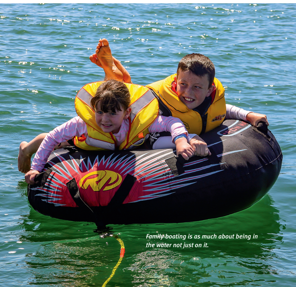
Family boating is as much about being in the water not just on it.