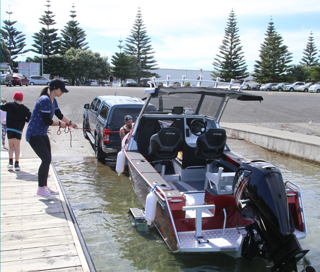
The Bradford's chose a sub-six metre boat for ease of handling, both in the water and on the trailer.

Rochelle's desire for a hardtop on a fibreglass boat extended further than their budget would allow. A further wander around the show and a visit to the Surtees stand to meet friends resulted in a switch from fibreglass to alloy, and the purchase of a brand-new Surtees 540 Workmate (the smallest hardtop boat currently on the NZ market) powered by a Mercury 90HP CT outboard.